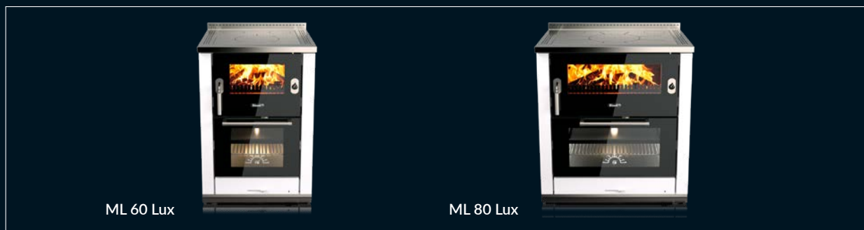
ML 60 Lux